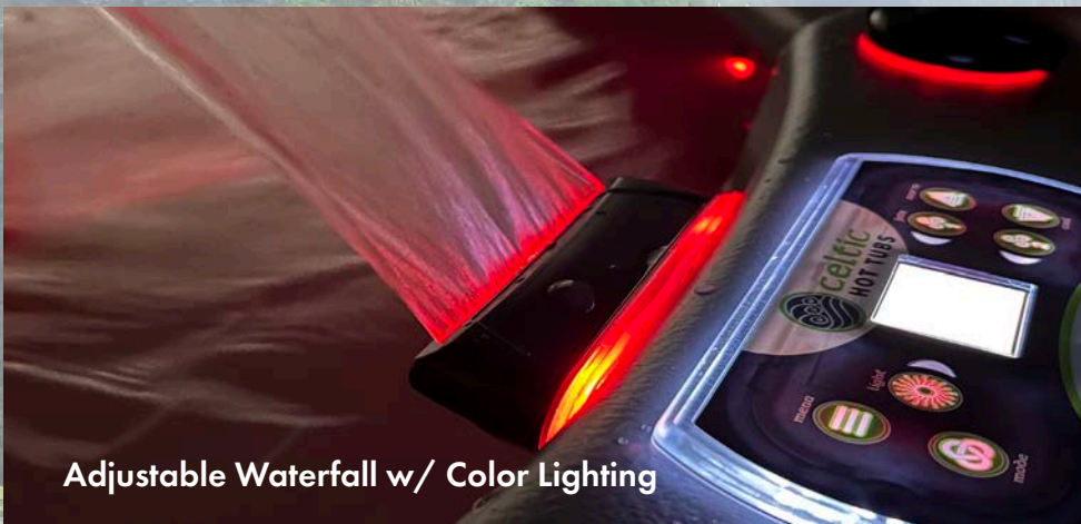
Adjustable Waterfall w/ Color Lighting